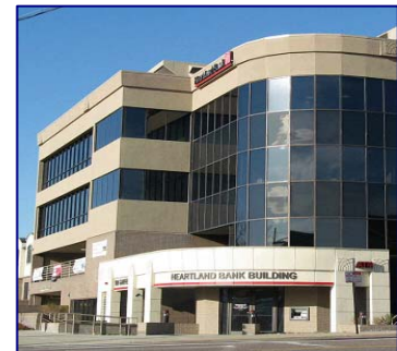
Heartland Bank Building, Denver, Colorado