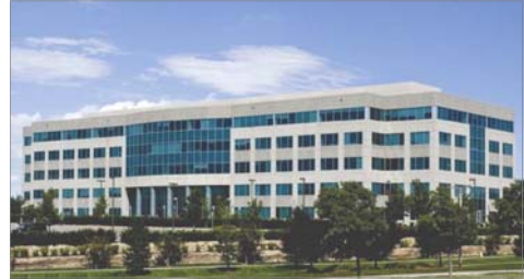
Build-to-Suit Office Building, Denver CO Developed for Hewlett-Packard

Build-to-Suit and Acquire-to-Suit Investors. Advisors also serves investors and developers that pursue build-to-suit or acquire-to-suit opportunities leased to third-party tenants (or for speculative lease-ups). In this role, we assist clients needing to undertake planning, entitlement, renovation or development activities in conjunction with the acquisition or development of a specific retail, office, industrial or hospitality facility. We also assist clients looking to execute strategic investment programs.